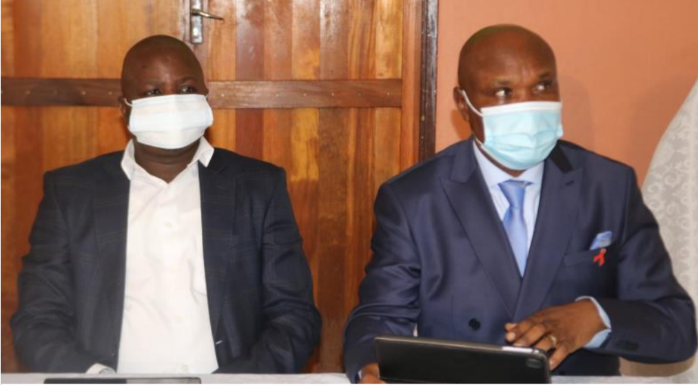
The Executive Mayor of Mopani District Municipality, Councillor Pule Shayi and Mayor Maripe Mangena at GTM SOMA.