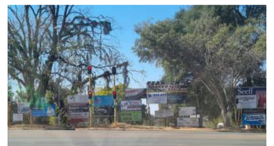
The area opposite the main entrance to Tzaneen Lifestyle Center before the clean-up and the area after the clean-up (below)

For further enquiries contact Maureen Ramabulana 015 307 8081 or Freddy Rammalo at 015 307 8290/082 809 0454 or Freddy.rammalo@tzaneen.gov.za .