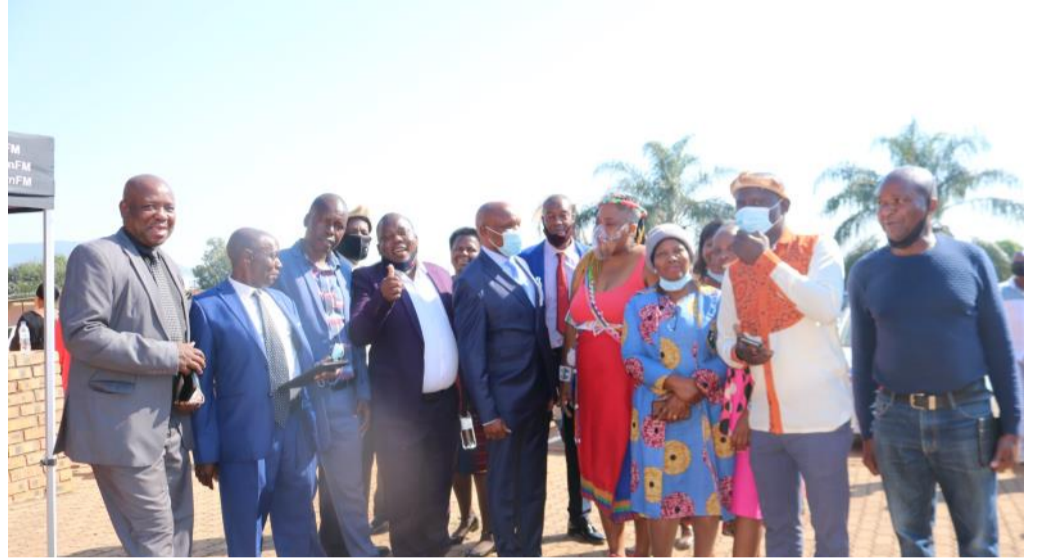
GTM Mayor Maripe Mangena flanked by GTM Councillors at the State of the Municipal Address