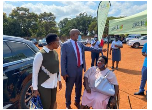
Mayor Maripe Mangena with former Minister of Communications Stella Ndabeni Abrahams and Acting Mayor for Mopani District Municipality Christianah Mohale