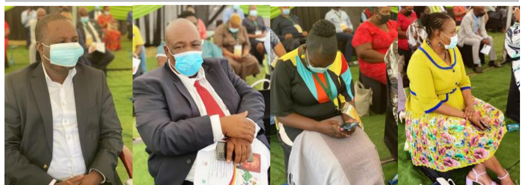
Pule Shayi MDM Executive Mayor