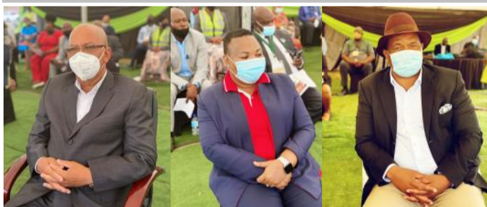
Premier Stan Mathabatha