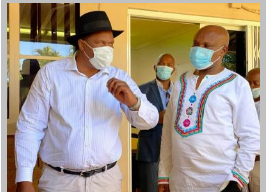
MEC for Economic Development, Environment and Tourism Thabo Mokone and Mayor for Greater Tzaneen Municipality Mayor Maripe Mangena