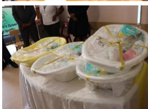
Bottom Left: Some of the baby hampers that the Mayor Mangena bought for the new babies.