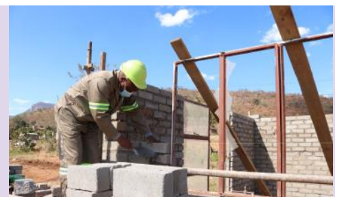
Mayor for GTM Maripe Mangena helping to build a house.

He said good Samaritans are supplementing what the government is providing.